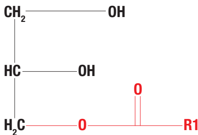
Figure 1. Monoglyceride Chemical Representation in MaxSimil Fish Oils (R1 = fatty acid)

Unique structure: One fatty acid attached to a glycerol backbone provides two polar ends that attract water and a non-polar tail end (R1) that attracts fat, thus enabling self-emulsification of the Monoglyceride Fish Oil formulas.